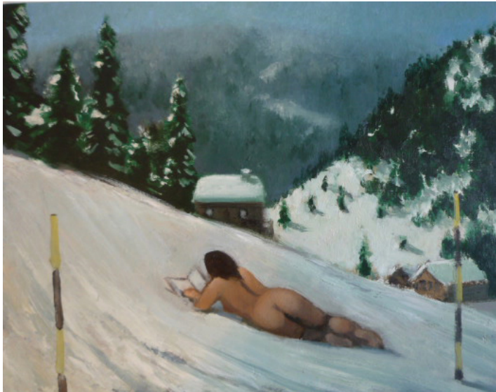
Johannes Hüppi Untitled , 2010 Oil on wood 30 x 37,5 cm