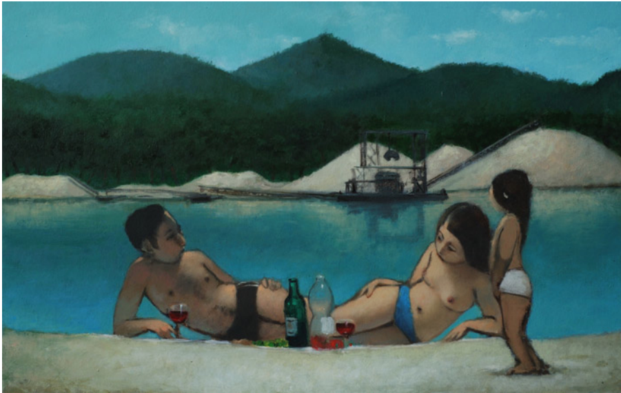
Johannes Hüppi Bagersee , 2014 Oil on wood 39,5 x 62 cm