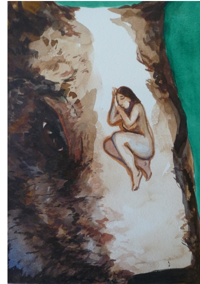
Johannes Hüppi Untitled , 2012 Watercolor and ink on paper 20,5 x 14,5 cm