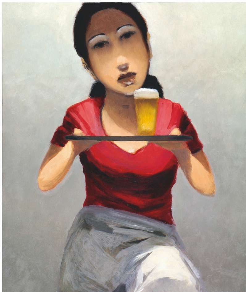
Johannes Hüppi Goldkettchen , 2014 Oil on cardboard 14 x 15 cm