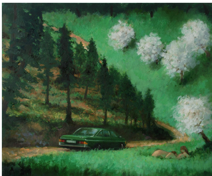
Johannes Hüppi Untitled , 2001 Oil on wood 28 x 35 cm