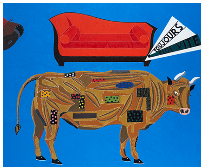
Eduardo Arroyo Monnaie espagnole , 1988 Oil on canvas 97 x 130 cm