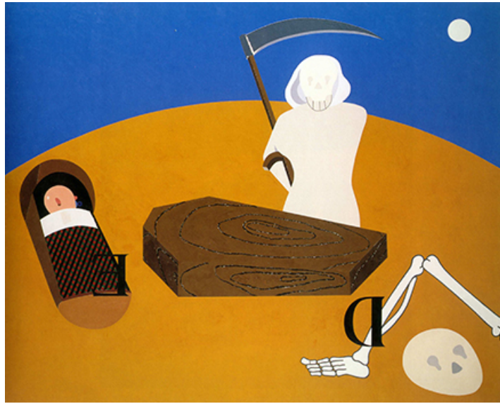
Eduardo Arroyo Rébus italien I , 1994 Oil on canvas 200 x 250 cm