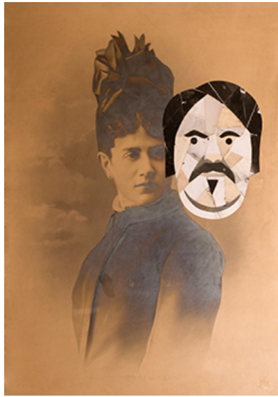
Eduardo Arroyo Balzac et Madame Hanska , 2014 Collage on paper 83 x 59 cm