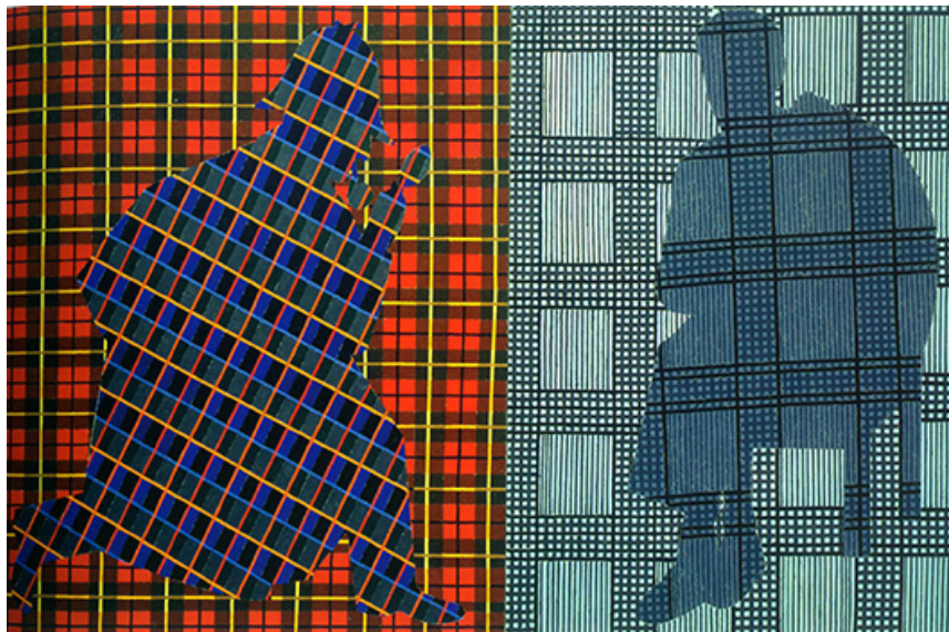
Eduardo Arroyo Prince of Wales & Scotland Yard , 1994 Oil on canvas Diptychon 220 x 360 cm