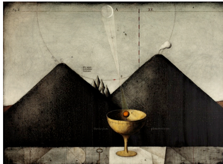
Friedrich Meckseper Monduhr , 1964 Oil on fiberboard 65 x 90 cm