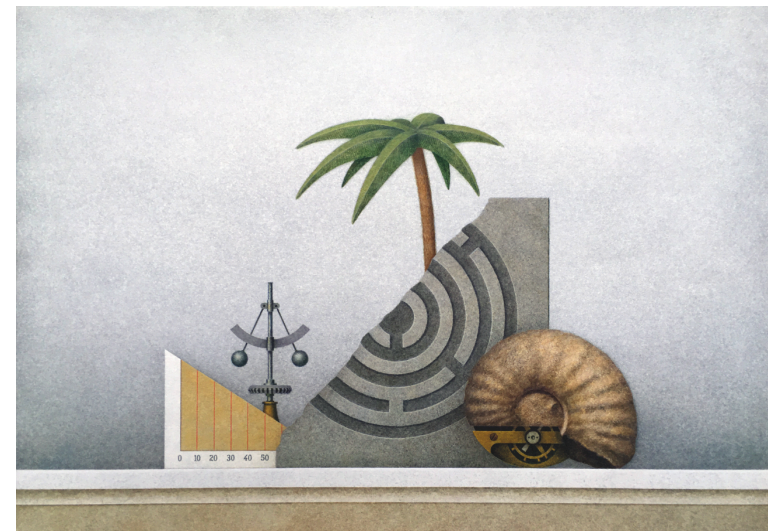
Friedrich Meckseper Amboß , 2009 Acrylic on canvas 70 x 90 cm