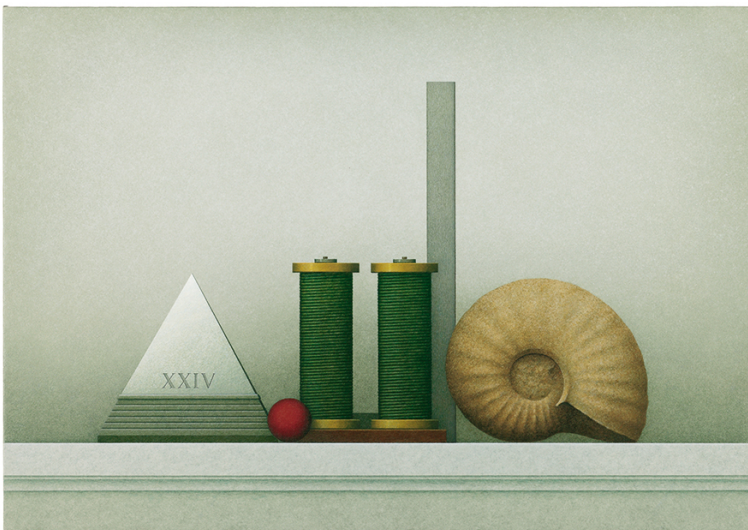
Friedrich Meckseper Stilleben , 2004 Acrylic on canvas 70 x 100 cm