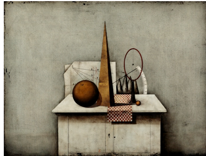
Friedrich Meckseper Tisch , 1963 Oil on fiberboard 63 x 83 cm